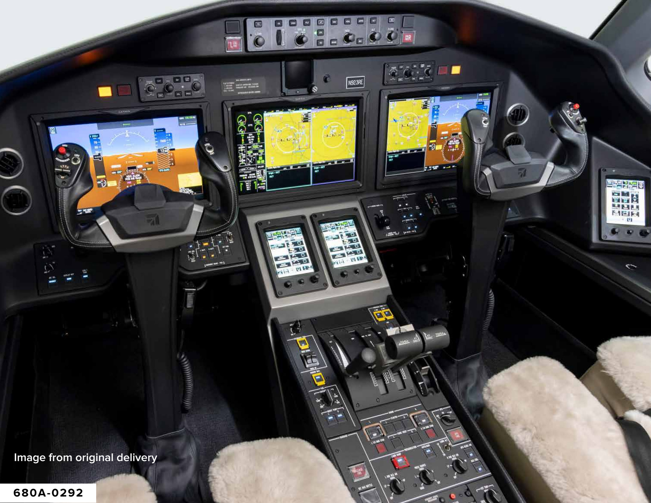
Image from original delivery