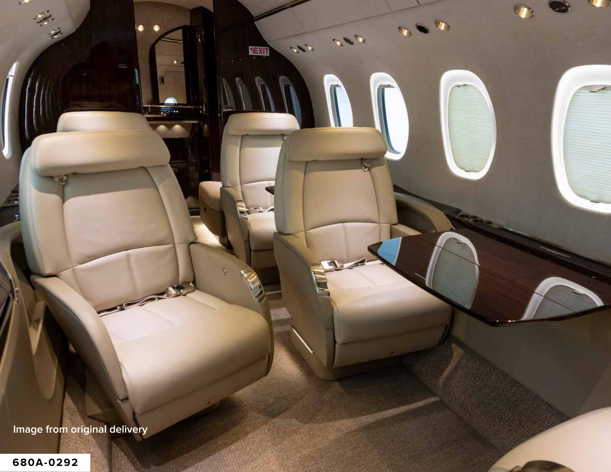
Image from original delivery