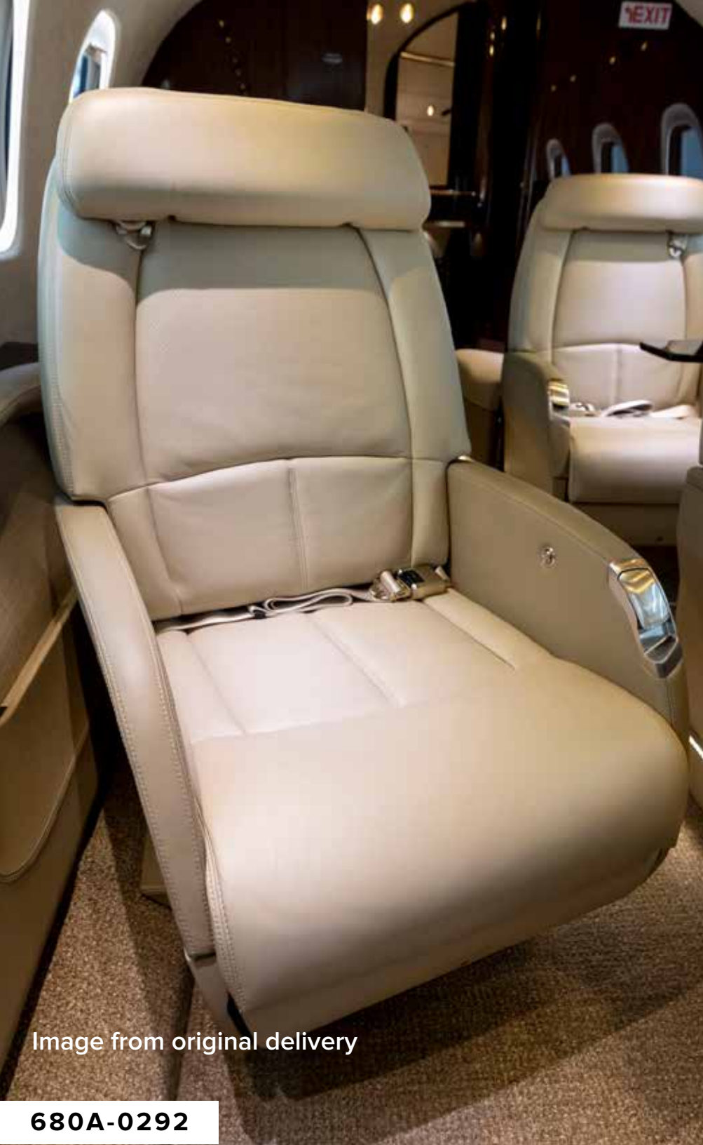
Image from original delivery