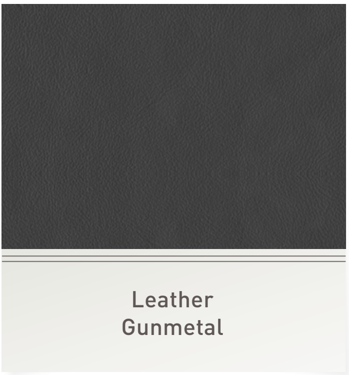
SIDEWALL & TABLE TOPS