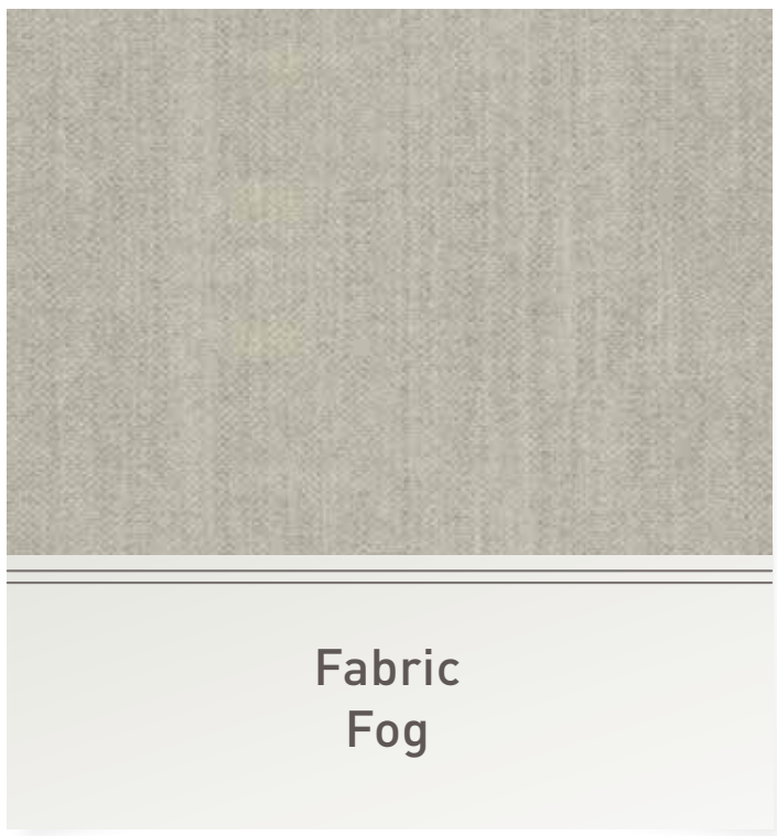
WINDOW REVEAL & CURTAIN