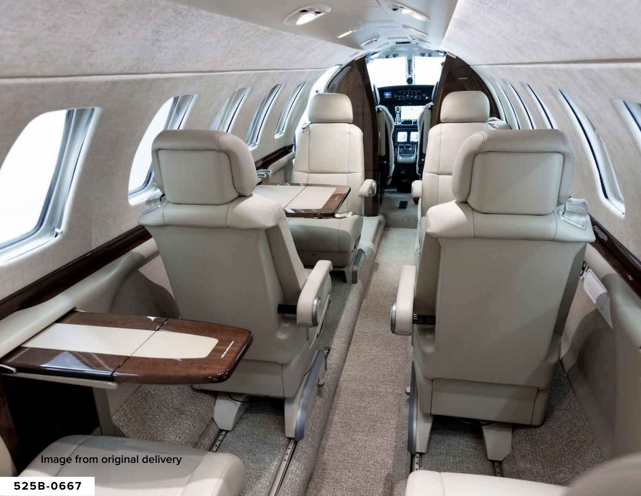
Image from original delivery