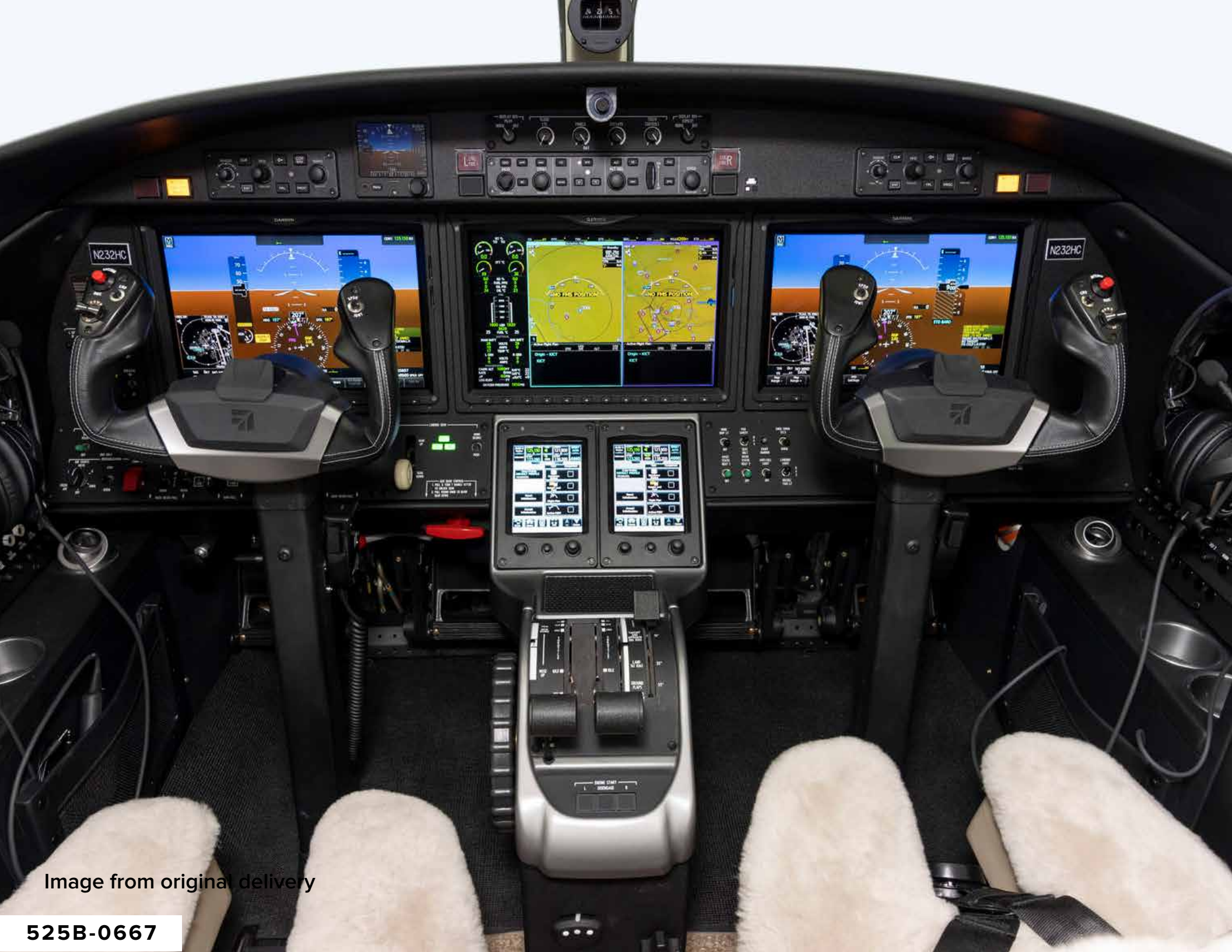
Image from original delivery