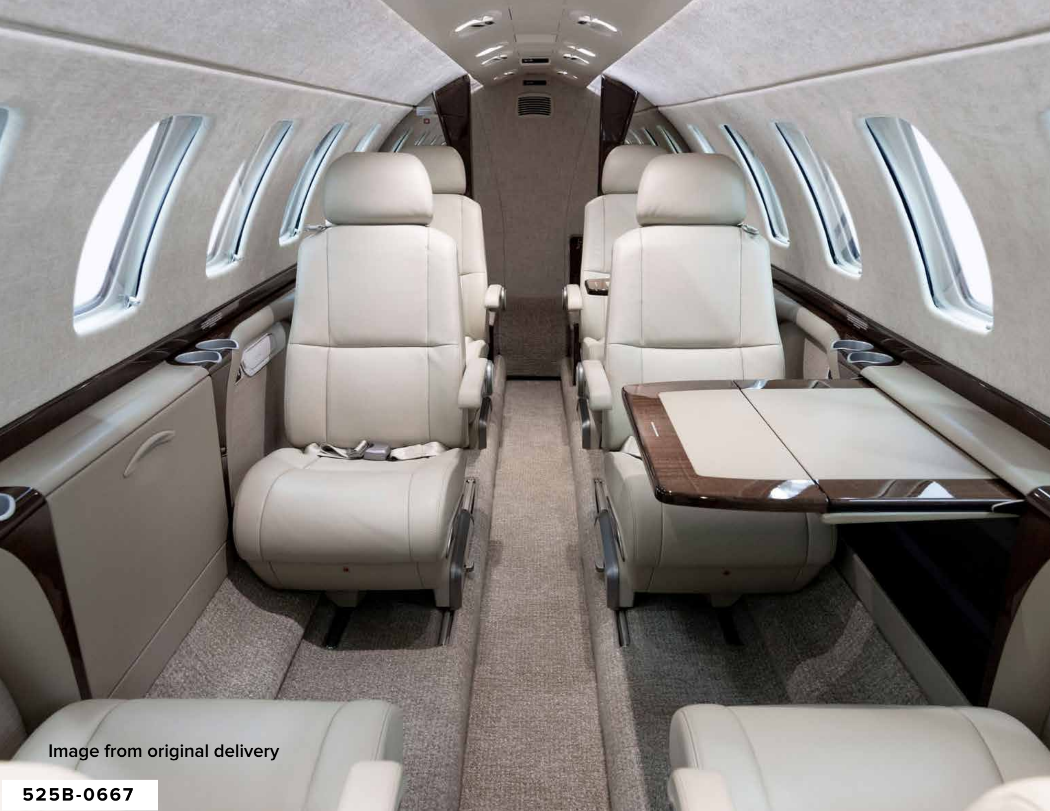
Image from original delivery