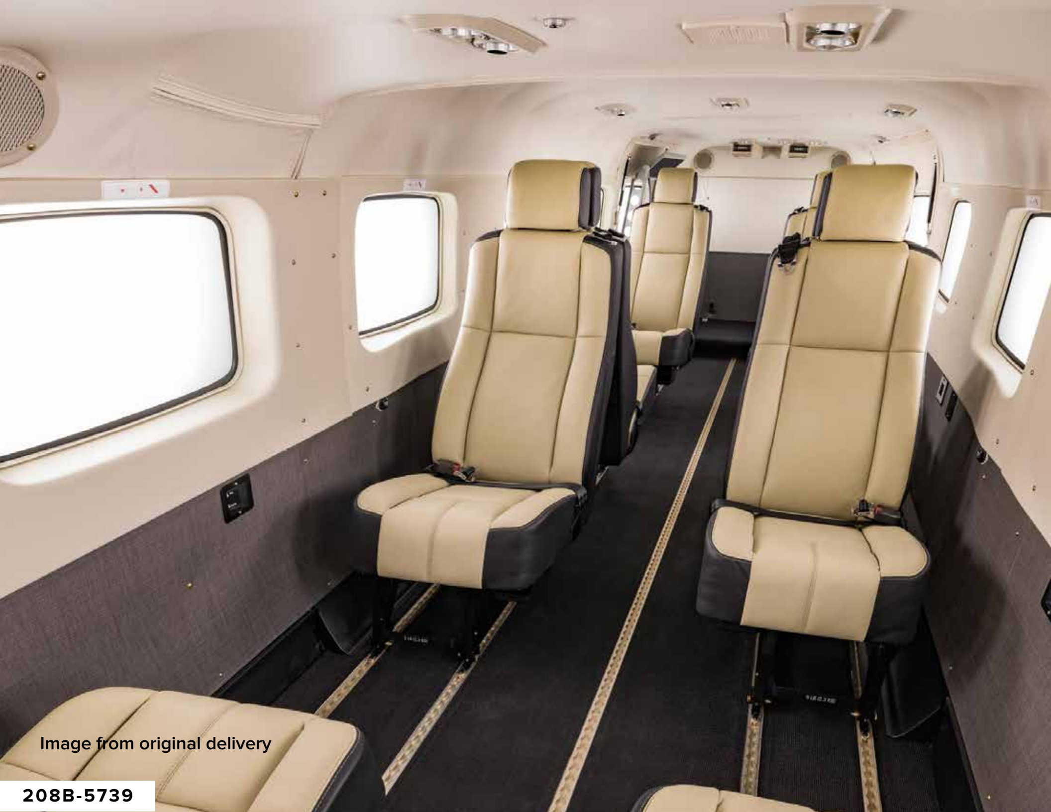
Image from original delivery