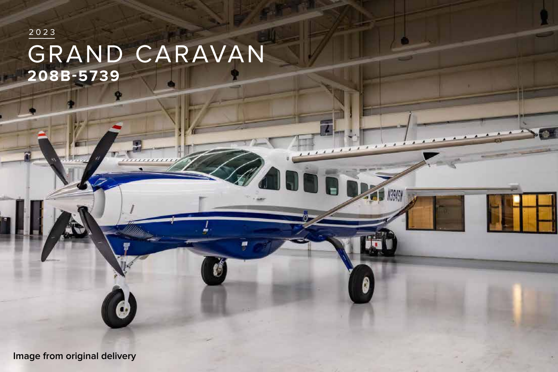
Image from original delivery