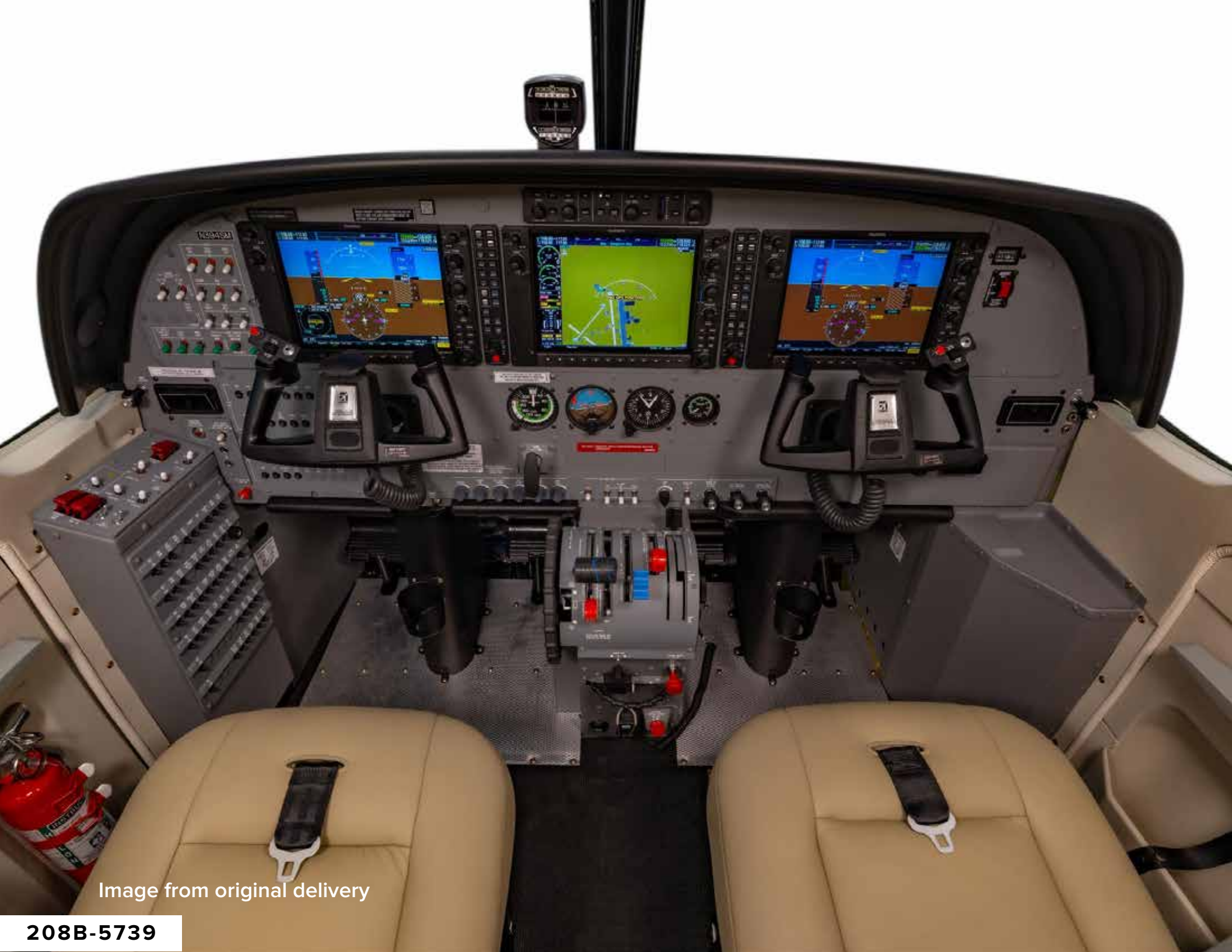
Image from original delivery