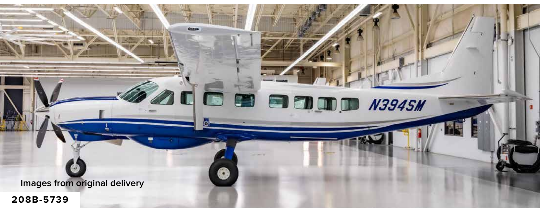
Images from original delivery