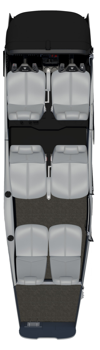
Figure 4: Typical Configuration